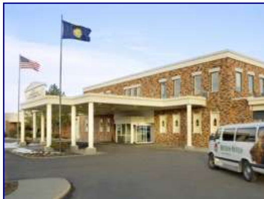
Red Lion Colonial Hotel in Helena

offices and their legal requirements, human resources, code of ethics, and the legislative process. A wide variety of current public officials will be the presenters.