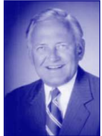
Governor Thomas L. Judge