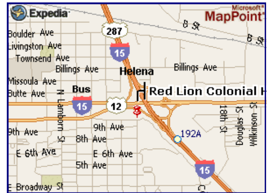
Directions to the Red Lion Colonial Hotel