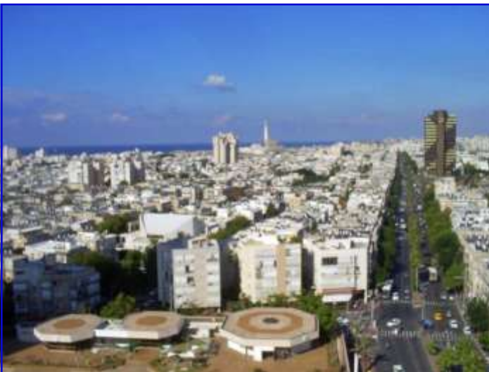
Tel Aviv, Israel

This small country, known in the news for constantly fighting its neighbors, is actually an advanced country making use of education, agriculture and high-tech to become an impressive