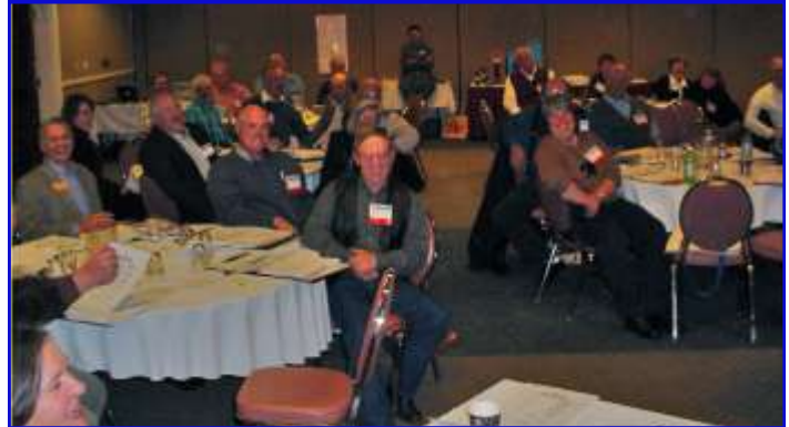
Various attendees from all over the state seemed to enjoy the program.

The Local Government Center was created in 1985 as a mandate from the Montana legislature. The Center's mission is to strengthen the capacities of Montana local government units to deliver essential services efficiently and to provide training, technical assistance and research to local officials. The Cen-