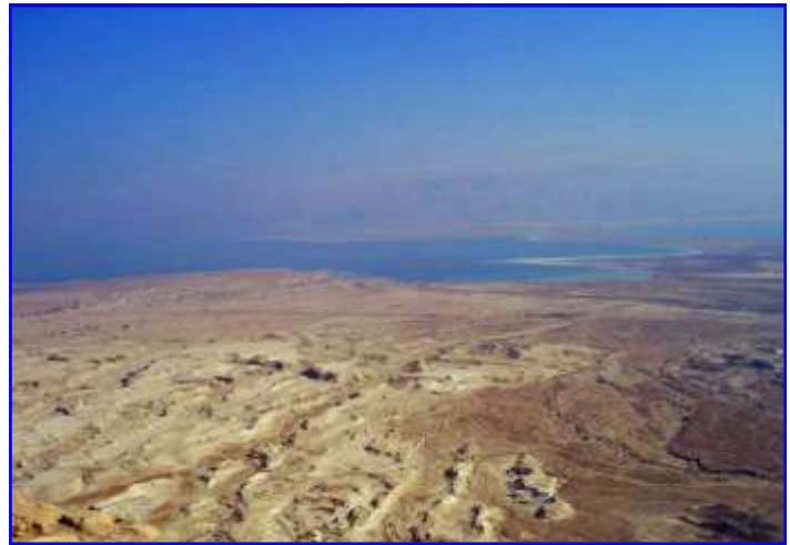
Masada overlooking the Dead Sea

Security of the Israeli borders is a number one ticket item. We toured the border, spoke with local government officials, and listened to their concerns before building a fence to protect their borders. Sound familiar? The Israeli government is