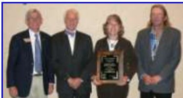
Ravalli Co. Road Department (top); Granite Co. Medical Center (left); and Yellowstone Co. (bottom) employees accept their awards Oct. 1.